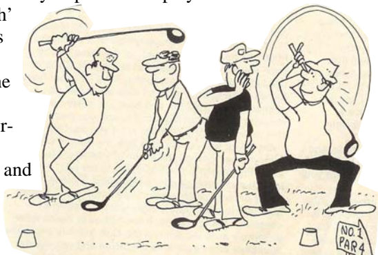
"Ok. You can knock off the goofy practice swing. I got us four a side!"

Give up the 'myth of the four-hour round' and accept the reality of the individual pace rating for each course Now, with an achievable goal in our sights, and our expectations in tune with the goal, we have a fighting chance of walking away feeling satisfied.